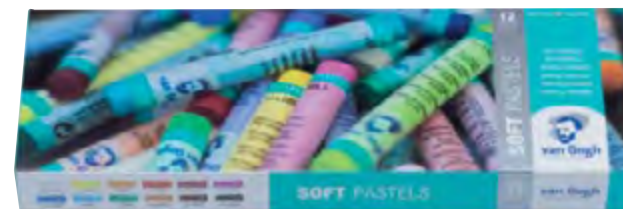
VAN GOGH SOFT PASTELS SET 12 COLOURS Contents: 12 soft pastels (100,5 - 202,5 - 205,5 - 227,5 - 331,3 - 372,5 - 409,5 - 506,5 - 545,5 - 570,7 - 619,5 - 700,5)