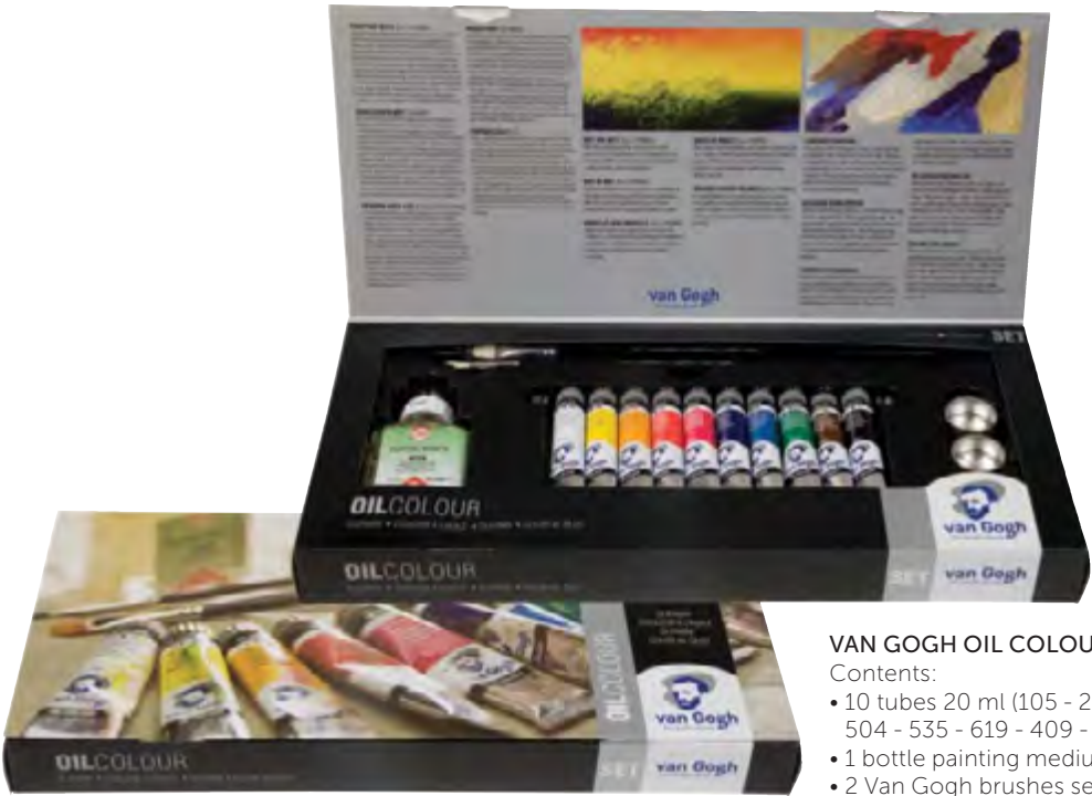
VAN GOGH OIL COLOUR COMBISET 10X20 ML Contents: • 10 tubes 20 ml (105 - 268 - 270 - 393 - 366 - 504 - 535 - 619 - 409 - 701) • 1 bottle painting medium 75 ml • 2 Van Gogh brushes series 210 no. 8 (Gussow model, hog bristle) and series 211 no. 4 (round model, hog bristle) • double palette cup