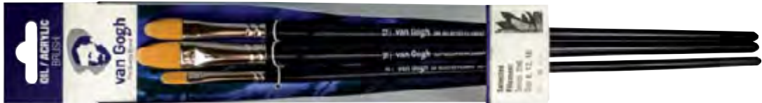
VAN GOGH OIL/ACRYLIC BRUSHES SET SERIES 296 (NO. 8-12-16) 90929690