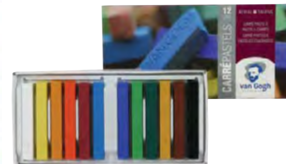
VAN GOGH CARRÉ PASTELS STARTER SET 90C12 Contents: 12 carré pastels