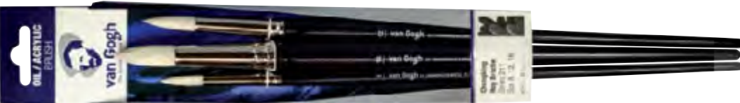
VAN GOGH OIL/ACRYLIC BRUSHES SET SERIES 211 (NO. 8-12-16) 90921190