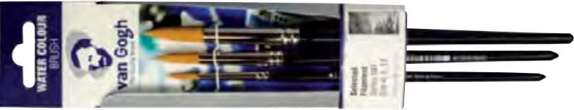
VAN GOGH WATER COLOUR BRUSHES SET SERIES 191 (NO. 4-8-12) 90919133