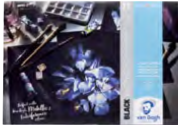
BLACK WATER COLOUR PAPER • 360 g/m 2 , 140 lbs • 100% cellulose • Fine grain • 12 sheets