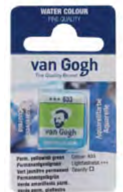
VAN GOGH WATER COLOUR PAN Available in 72 colours