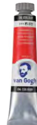
VAN GOGH OIL COLOUR TUBE 20 ML Available in 66 colours