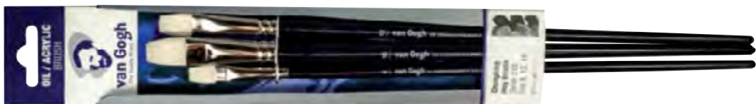
VAN GOGH OIL/ACRYLIC BRUSHES SET SERIES 210 (NO. 8-12-16) 90921090