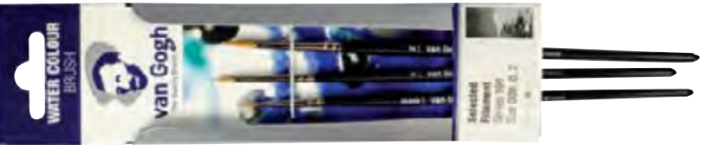
VAN GOGH WATER COLOUR BRUSHES SET SERIES 191 (NO. 000-0-2) 90919132