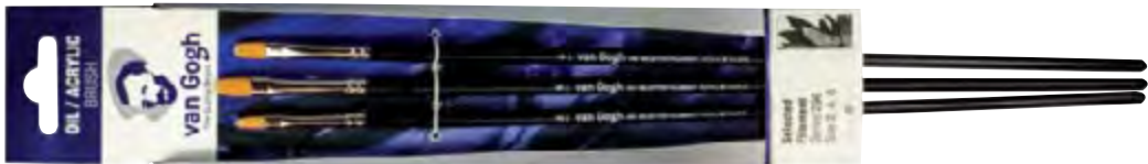
VAN GOGH OIL/ACRYLIC BRUSHES SET SERIES 296 (NO. 2-4-6) 90929691