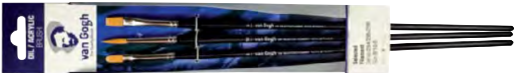
VAN GOGH OIL/ACRYLIC BRUSHES SET SERIES 294 (NO. 8), 295 (NO. 10) 296 (NO. 6) 90929692