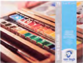
WATER COLOUR PAPER • 300 g/m 2 , 140 lbs • 100% cellulose • Cold pressed fine