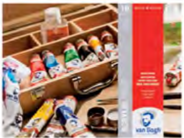
ACRYLIC PAPER • 370 g/m 2 , 173 lbs • Medium grain • 10 sheets