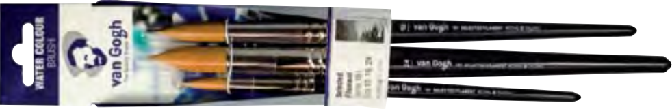
VAN GOGH WATER COLOUR BRUSHES SET SERIES 191 (NO. 10-18-24) 90919134