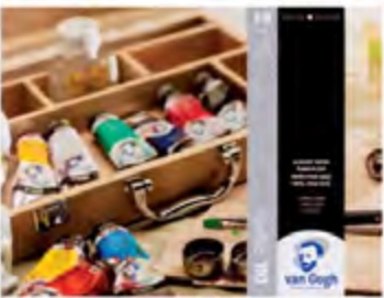
OIL PAPER • 240 g/m 2 , 111 lbs • Canvas grain • 10 sheets

Van Gogh Paper is made from high-quality cellulose and is lignin free. It is also acid free, which ensures the work remains in good condition for a long time. Van Gogh black water colour paper is ideal for creating an impressive water colour painting on a dark ground.