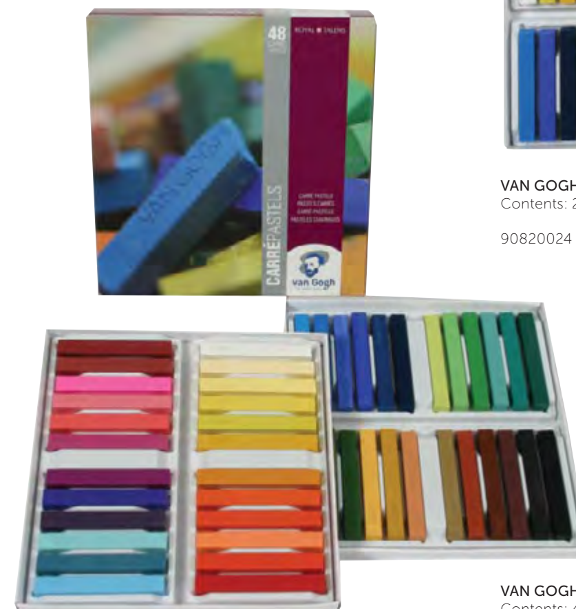
VAN GOGH CARRÉ PASTELS SET 48 COLOURS 90C48 Contents: 48 carré pastels