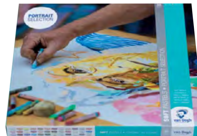
VAN GOGH SOFT PASTELS SET PORTRAIT SELECTION Contents: 36 Van Gogh soft pastels (100,5 - 202,5 - 205,5 - 227,5 - 231,3 - 235,9 - 331,3 - 331,9 - 339,7 - 347,7 - 347,9 - 370,7 - 371,8 - 372,5 - 372,10 - 397,3 - 397,7 - 408,7 - 409,3 - 409,9 - 411,5 - 411,9 - 505,9 - 506,5 - 536,9 - 538,5 - 548,5 - 570,7 - 620,5 - 626,3 - 626,10 - 627,10 - 704,3 - 704,10 - 707,7 - 707,9)