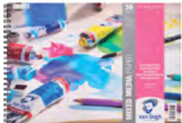
MIXED MEDIA PAPER • 300 g/m 2 , 140 lbs • 30 sheets