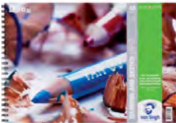
DRAWING AND SKETCH COLOUR PAPER • 160 g/m 2 , 75 lbs • Fine grain • Spiral microperforated • 40 sheets