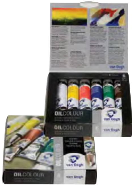
VAN GOGH OIL COLOUR STARTER SET 02C406 Contents: 6 tubes 20 ml (105 - 268 - 393 - 619 - 409 - 512)