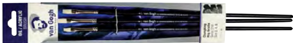
VAN GOGH OIL/ACRYLIC BRUSHES SET SERIES 210 (NO. 2-4-6) 90921091