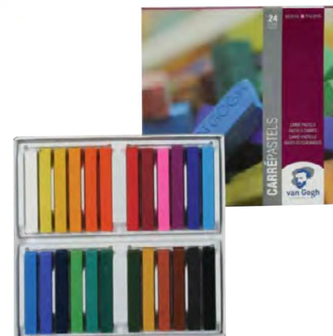
VAN GOGH CARRÉ PASTELS BASIC SET 90C24 Contents: 24 carré pastels