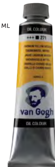
VAN GOGH OIL COLOUR TUBE 60 ML Available in 66 colours