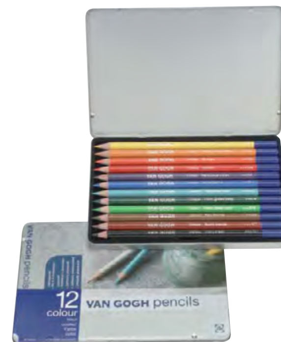
VAN GOGH COLOUR PENCILS STARTER SET GCP M12 Contents: 12 colour pencils