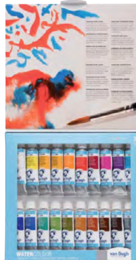
VAN GOGH WATER COLOUR TUBE 10 ML Available in 72 colours