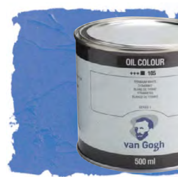
VAN GOGH OIL COLOUR TIN 500 ML Available in 4 colours