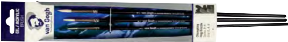
VAN GOGH OIL/ACRYLIC BRUSHES SET SERIES 211 (NO. 2-4-6) 90921191