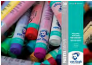
PASTEL PAPER • 160 g/m 2 , 75 lbs • Off white • 30 sheets