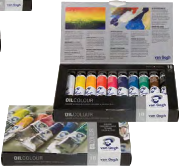
VAN GOGH OIL COLOUR BASIC SET 02C410 Contents: 10 tubes 20 ml (105 - 268 - 270 - 393 - 366 - 504 - 535 - 619 - 409 - 701)